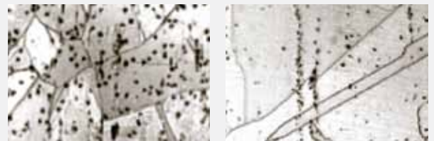
CuCrZr before and after annealing at 900°