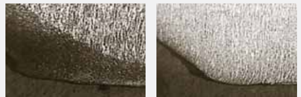
CuCrZr after 1200 welds